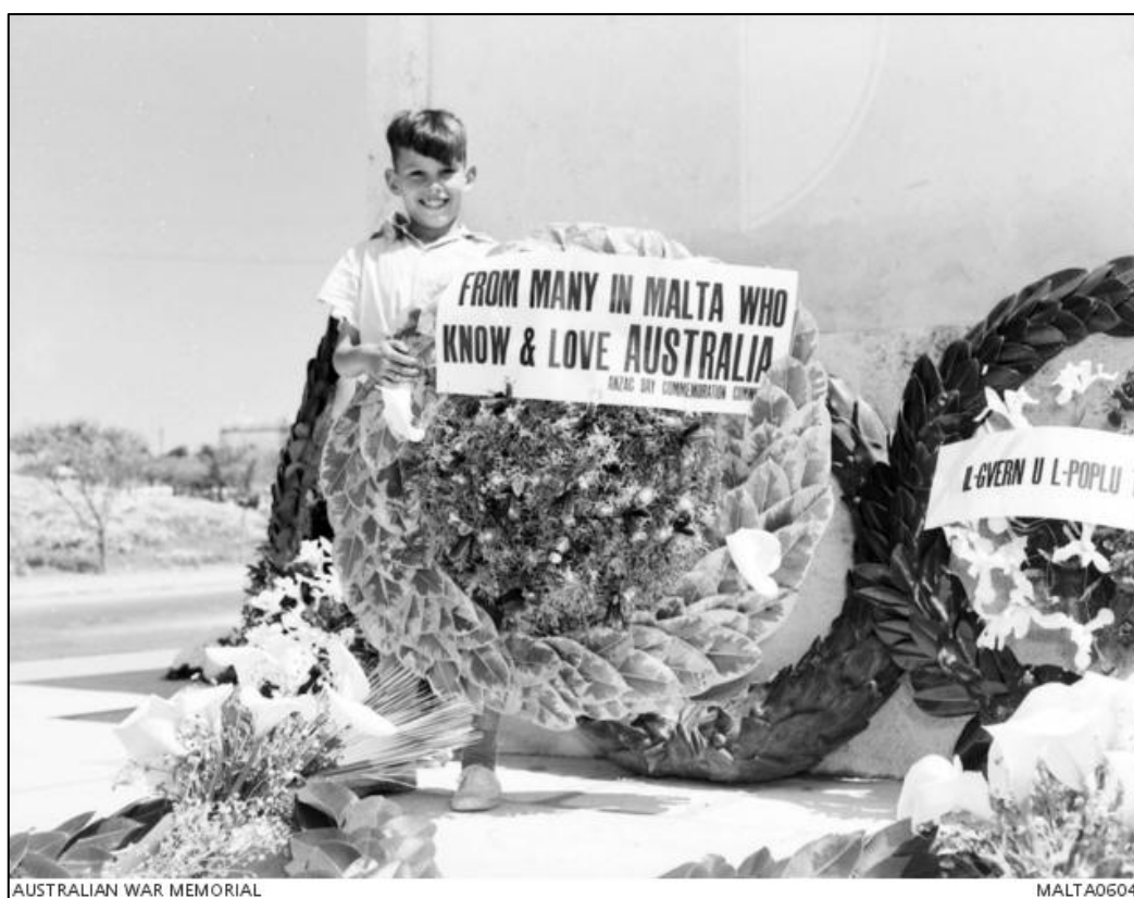
A young Maltese boy poses amidst some of the wreaths on the Malta War Memorial after the Anzac Day service in 1953 which was organised by the Malta Anzac Committee and 78 Fighter Wing RAAF.

After the unveiling of the War Memorial in Floriana by HM The Queen in 1954, services were combined up until 1979 when the service returned to Pietà Military Cemetery, as it contains the highest number of ANZAC war graves (231) in Malta.