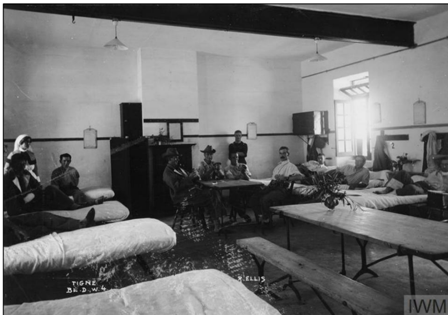
Wounded Australian and British soldiers at Tigne Hospital: Building D, Ward 4., Malta.

Once used to refer to those who fought in the First World War, as time has passed, the term 'Anzac' has come to express characteristics such as courage, equality, endurance and mateship, and today it also honours those who have served through more recent conflicts and on peacekeeping missions.