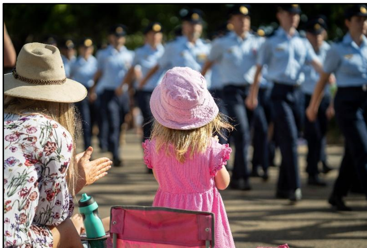
Anzac Day Parade, Townsville 2023.

The Department of Veterans Affairs Anzac Portal provides free learning resources for Australian educators and student friendly information and engaging learning activities, on the experiences of Australians in wars, conflicts and peace operations. It is designed specifically for teachers and students in Australian schools. The below case studies, collected by DVA through the Anzac Day Schools' Awards, provide brief descriptions of how some school communities in Australia have learned about and commemorated Anzac Day.