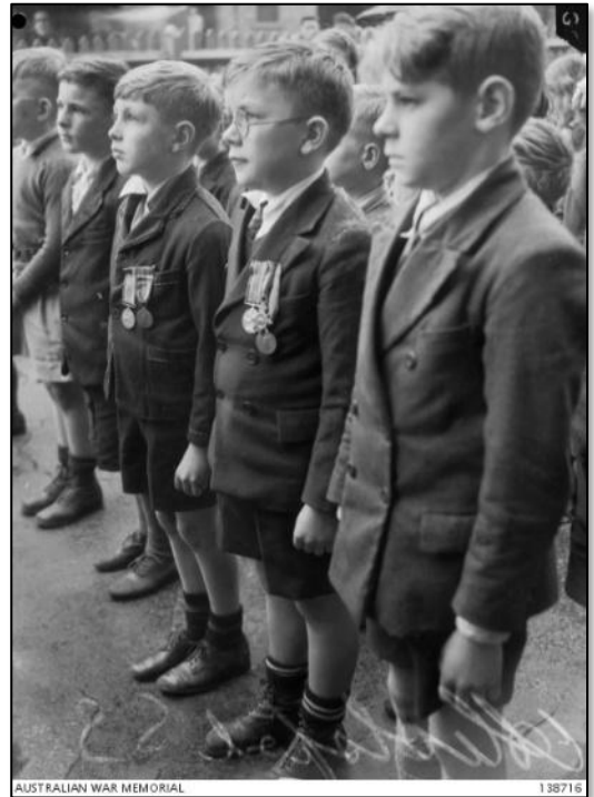
Abbotsford, Vic. 1943. Pupils wearing their father's medals listen quietly during the Anzac Day ceremony at the local state primary school.

A 2025 News Corp Growth Intelligence Centre survey indicated that 63% to two-thirds of Generation Z Australians believe the Anzac legacy should be preserved for future generations.