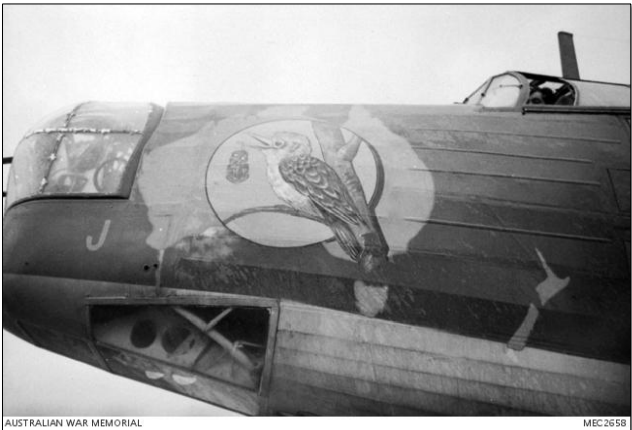
A Wellington bomber of 458 Squadron, Royal Australian Air Force (RAAF) with the call sign 'J' for Johnny displaying a large section of nose art depicting a map of Australia and New Zealand which has been over painted with a large Kookaburra holding a tiki in its beak.

The Malta Memorial in Floriana commemorates 205 Australian and 85 New Zealand service personnel who were killed in action during the Second World War with no known grave; the majority of these were air crew. A further thirty-one Australian and New Zealand air crew are buried in Kalkara Naval Cemetery and one Australian in Pembroke military cemetery.